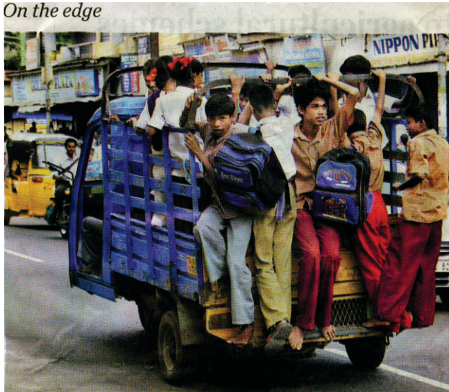
JUST A FOOTHOLD WILL DO: Be it city bus or any other modes of transport, school boys throw caution to the wind and travel on footboard, as seen in Madurai.