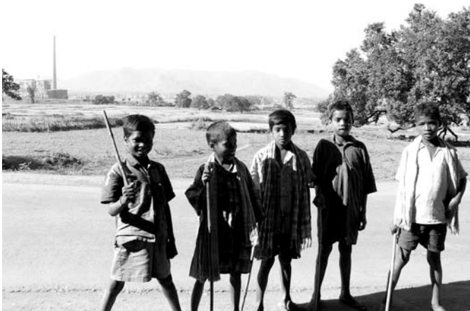
Child labour outside NALCO township

Child labour is a clear indication of the social and economic status of a community, coupled with the inaccessibility to basic education, the reduced livelihood opportunities and landlessness due to the mining project. All these factors have resulted in more children dropping out of school to supplement their family incomes. Also, the township's demand for domestic labour has increased the female girl child's absorption into menial labour as house-maids and domestic help. The youth who were interviewed stated that as they do not qualify for the matriculation examination due to their poor school education, and very few are able to reach college level education, they end up as cleaners and drivers of trucks, ply autos and buses for private contractors or are hired in petty shops and businesses.