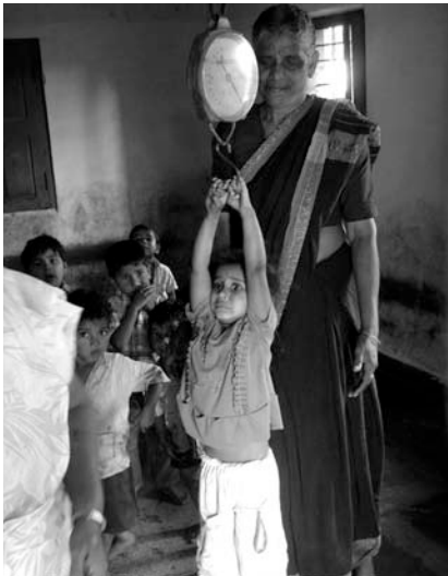
Child hanging to the weighing scale, which was lying rusted, at Sultanpura anganwadi . No record of children's growth maintained (Photo December 2009)

The anganwadi in Sultanpura showed 66 children enrolled although there are 85 children below 6 years of age in the village. On the day of our visit there were only 17 children present and the teacher hastily came to the anganwadi , upon hearing that a team was visiting.