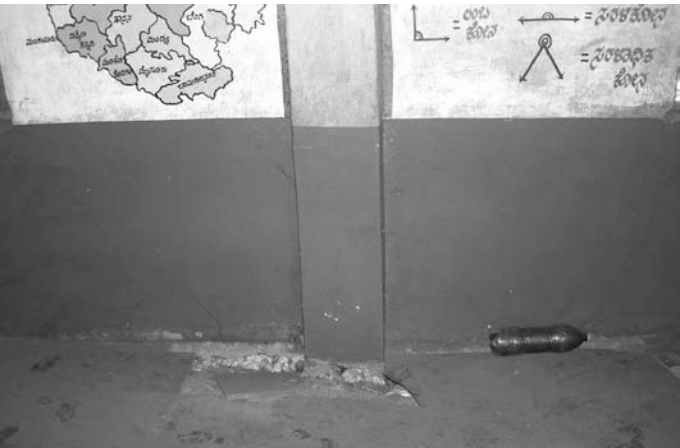
Classroom of Valmikinagar primary school damaged due to mine blasting operations near Kariganuru, Hospet, Karnataka (Photo January 2010)

The primary school in Valmikinagar, Kariganuru has 105 children enrolled. There are only three teachers for classes I to V and four classrooms of which one is damaged due to mine blasting activities happening nearby. According to the headmaster only 80–85 children attend school regularly but