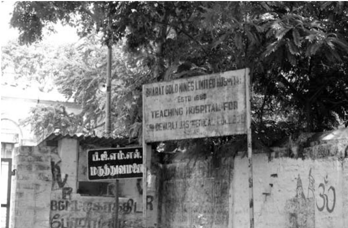
Closed BGML Hospital in Kolar township which provided free medical services for workers and their families (Photo June 2009)

requirements of the township as well as the general public of the taluka as it is highly understaffed. The Medical Officer reported that the workers mainly suffer from respiratory illnesses, chronic bronchitis, asthma, tuberculosis (TB) and silicosis although the latter is not an officially confirmed diagnosis as most silicosis patients, to the convenience of the state and the industry, are diagnosed with tuberculosis. The health problems of the children, as reported by the Medical Officer relate to respiratory illnesses, skin diseases, bronchitis and malaria. The Medical Officer also stated that there were cases of HIV/AIDS and Sexually Transmitted Diseases (STD) but it was hard to state whether they were from the township or outside as the workers do not have a separate hospital now. The workers' families are unable to meet the medical expenses, so some of the workers' unions are voluntarily helping the families in accessing medical facilities. Therefore the burden of supporting the families has fallen on the youth again.