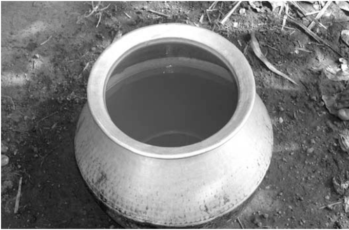
Contaminated drinking water in mine workers' colonies, Sundergarh (Photo November 2009)

the company and the mine tailings were dumped into the river converting into a highly polluted water body unfit for consumption. It was evident that the water in the entire region is contaminated and consists of heavy metals and dust, as a result of overdrawing of water and dumping of mine waste. The sponge iron factories have dug up bore-wells creating serious groundwater depletion. The 49 sponge iron factories with each having 15–20 deep bore-wells having a depth of about 800 ft from the ground level is more than a cause for alarm for the people of this region.