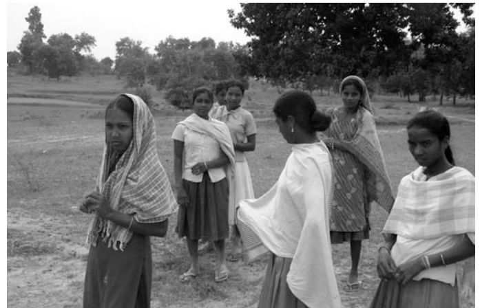
Young girls working in Dolomite mines and stone crushers at Birmiritrapur, Sundergarh (Photo November 2009)

Children from displaced families and mine workers' families were found to be working either in mining or other ancillary