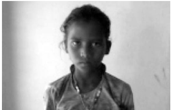
Child engaged in stone quarry at Kaliberi (Photo July 2009)

A brief survey on the quarry workers' children was undertaken in three mandals of Chittoor district in Andhra Pradesh, by Mitra Association for Social Services (MASS), which is based in Palamaner. Palamaner mandal is situated on the borders of the states of Tamil Nadu and Karnataka and consists of 16 panchayats and 96 habitations. Baireddipalli mandal is situated in the borders of Karnataka state which consists of 24 panchayats and 102 habitations. Peddapanjani mandal is situated in the border of Karnataka state and consists of 22 panchayats and 302 habitations. This area was selected because of the presence of clusters of traditional stone-breaking communities and because of the work of MASS with these communities.