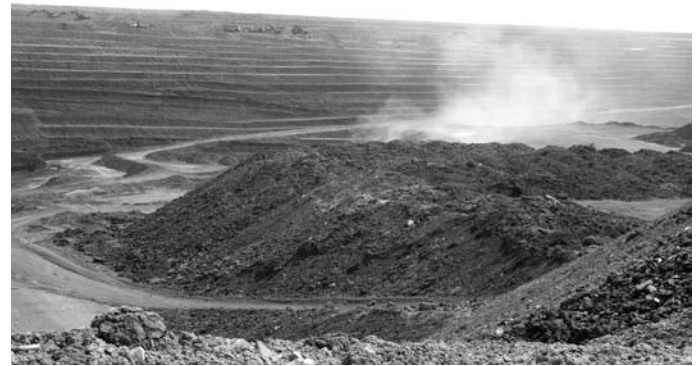
Lignite mining in Barmer district (Photo July 2009)

Rajasthan produces 10 per cent of the world's and 70 per cent of India's, output of sandstone. 86 Given that most of the mining and quarrying in Rajasthan is carried out on small, informal sites, and that illegal mining is reportedly rampant, it is difficult to estimate the actual size of the workforce in the state. According to the Census, there were 233,130 people (main and marginal workers) employed in mining