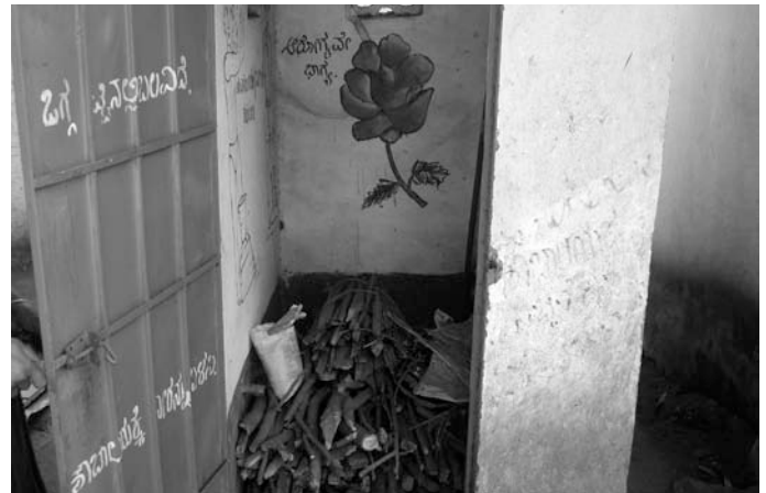
Toilet being used to keep firewood at Sultanpura anganwadi in Sandur (Photo December 2009)

The doctors at the CHC in Toranagallu, Sandur, gave their medical observations of the health problems in the taluk . They felt that the large number of steel plants set up in Sandur have created air pollution with toxic fumes from the chimneys causing allergies and infections to the people in the surrounding areas. Children particularly, are exposed to this from birth and are therefore, having respiratory illnesses. The CHC records here show 59 cases of TB and 51 cases of HIV/AIDS, most of whom were mine workers. The hospital