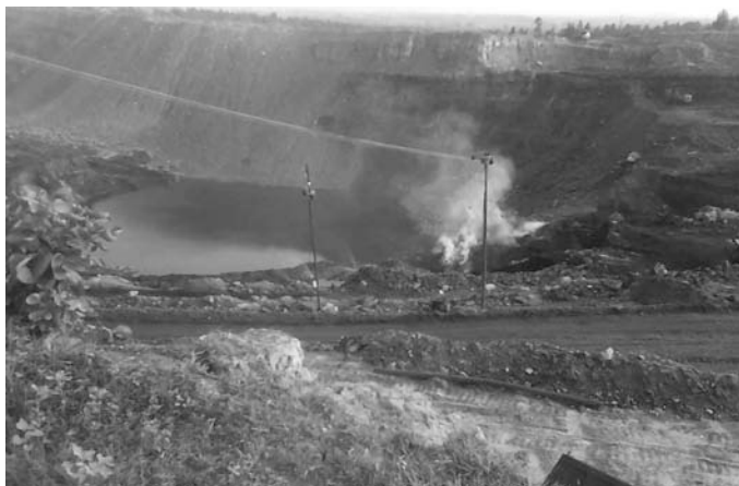
The burning coal from CCL mines, Hazaribagh (Photo September 2009)

In 2007-08, Jharkhand was the leading producer of coal and kyanite, and the second leading producer of gold in the country. The state accounts for about 35 per cent of rock phosphate, 29 per cent of coal, 28 per cent of iron ore, 16 per cent of copper ore and 10 per cent of silver ore resources of the country. In 2007-08, the value of mineral production in Jharkhand was Rs. 95.28 billion, an increase of 11.5 per cent from the previous year. In terms of value, over 90 per cent of the state's