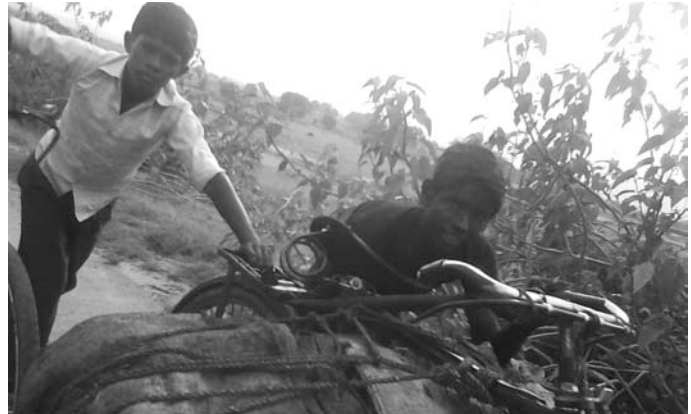
Boys walk with cycle loads of coal for 3–4 days at a stretch, to sell coal in the big towns Hazaribagh (Photo September 2009)

Jharkhand is a state predominantly having an adivasi population living in the midst of the curse of mineral