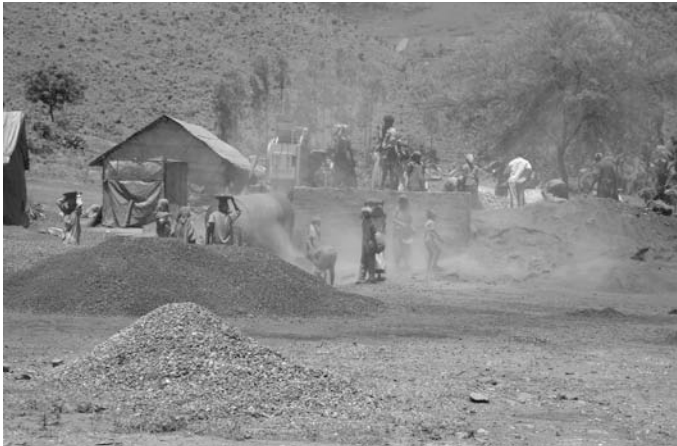
Iron ore mining in Hospet (Photo- June 2009)

is also the sole producer of feldspar and the leading producer of iron ore, chromite and dunite. The state hosts 78 per cent of India's vanadium ore, 74 per cent of iron ore, 42 per cent of tungsten ore, 38 per cent of asbestos, 33 per cent of titaniferous magnetite and 30 per cent of limestone, as well as less significant proportions of a number of other minerals. 19