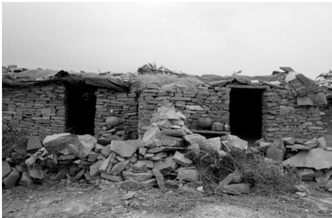
Houses of stone quarry workers in Jodhpur. (Photo July 2009)

Residents of an ST village in Jodhpur district, Bhat Basti, located close to Kaliberi mining area, explained how they used to be nomadic, but because of the increase in population in Rajasthan and less land availability, they could no longer find land for livestock grazing. As a result 20 years ago they were forced to sell their animals and move to this site, close to the mines in the hope of finding work. 94 There