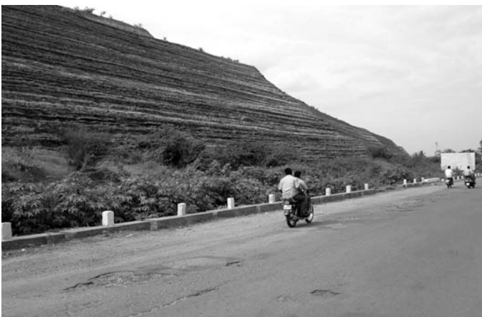
Cyanide heap in the middle of Kolar township—the controversial hill that is supposed to be causing radiation (Photo June 2009)

The mine tailings or the cyanide hill as it is popularly known is located in the center of the township. Ironically, while it