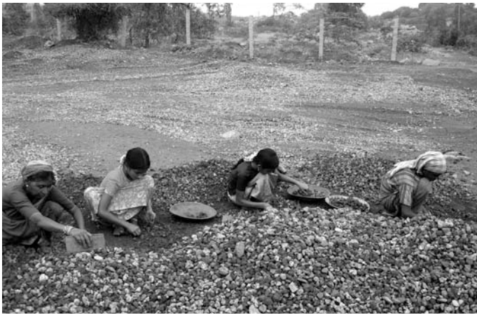
Young girls are engaged in sorting and breaking of iron ore, working 8 hours a day, at Kariganuru, Hospet (Photo December 2009)

number of children working in the mines and in other non-mining activities. Many of the children are from migrant families. Some of the migrant families have settled down in the slums in Hospet while many migrate only seasonally for mine labour. Children are engaged in breaking of stones, digging, dumping and also in cleaning of trucks. Many, as they live on the site and accompany their parents, start working even at the age of five and six and are adept at their work by the age of 10. Boys from the age of 12 start taking on the more difficult work of breaking the larger boulders and stones while the girls are engaged in breaking these into small stones, powdering them into iron ore filings and in loading activities. The average earning of the children working in mining activities ranges between Rs.80 and Rs.100 per day.