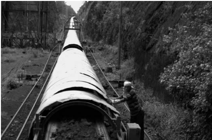
NALCO conveyor belt

In 2007-08, there were 227 reporting mines in the state. The total mine lease area covers 721,323 ha of land. This includes over 16,795 ha of forestland which has been officially diverted for mining. 252