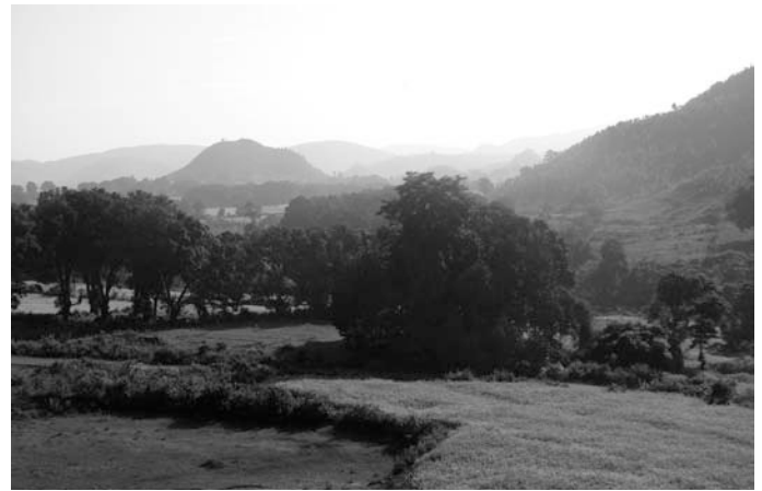
Forest and agricultural land threatened by mining in Kasipur (Photo October 2009)

Orissa is one of the largest producers of rice in India, growing almost 10 per cent of the total rice produced. The state also