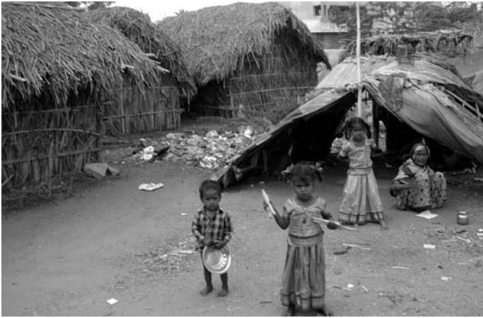
Children of mine workers in Hospet slum—many children work in garages, tea stalls, mine sites, as truck cleaners coolies, loaders, domestic labour (Photo January 2010)