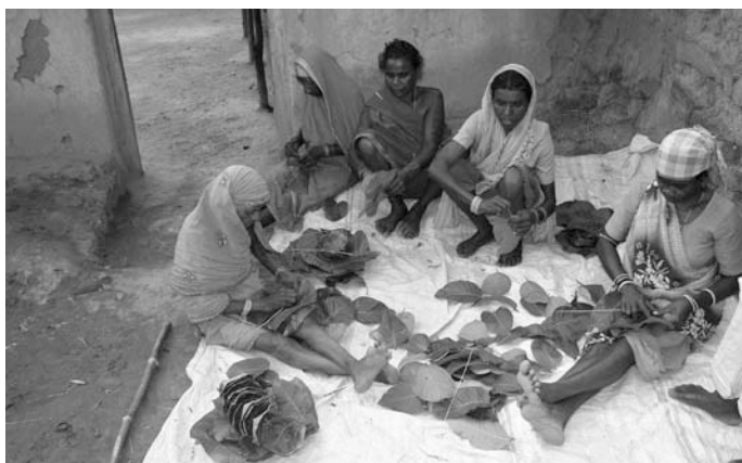
Local livelihoods destroyed due to mining activities (Photo November 2009)

Another serious issue, as stated by an activist from the Raigarh-based Jan Chetana People's Movement 196 , is that mining companies are simply acquiring rich agricultural land on which farmers are dependent for their sustenance, even if they do not do mining. This is the case of Jindal Steel and Power Plant, which got the lease in June 2006 but has not undertaken any mining activities till date. Technically, the lease should be cancelled as per the rules of the Ministry of Environment and Forests, but the Jindals continues to hold control over the land because of its sheer muscle power over the state machinery.