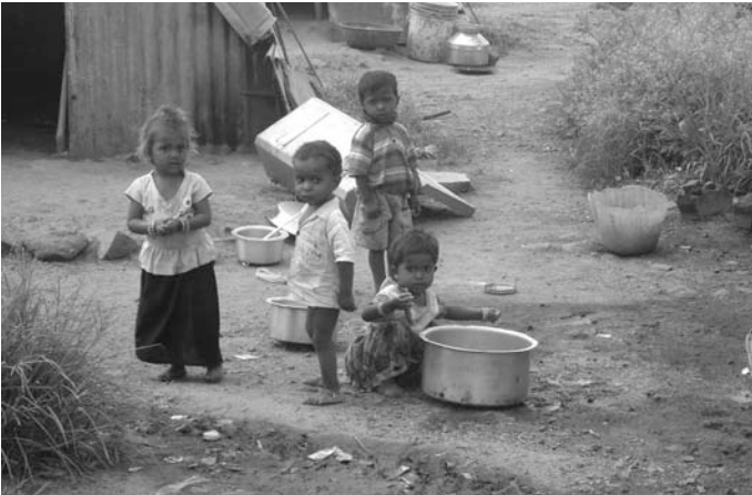
Basic housing and sanitation are absent in stone quarry workers' colonies—children consuming polluted water (Photo September 2009)

most of the sites the women complained that they often fell sick on consuming the water.