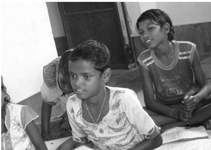
NCLP school, Birmitrapur, Sundergarh (Photo November 2009)

According to the Department of Mines, Orissa, Sundergarh district has a total of 87 working mines of which dolomite and limestone are 19 and dolomite alone is four. There are 268 applications for mining leases still pending with the department. There are also 49 sponge iron factories in the district. Each factory has 15–20 deep bore-wells whose depth is at least 800 ft from the ground level. Some of the sponge iron plants and mines had to be closed down due to non-compliance with pollution norms. It is a known fact, as expressed by the ex-Chairman of Birmitrapur Mr. Kishore Kujur, that there are as many illegal mines as legal mines in the region. The government is now inviting multinational corporations to establish large-scale industries of cement in Sundergarh.