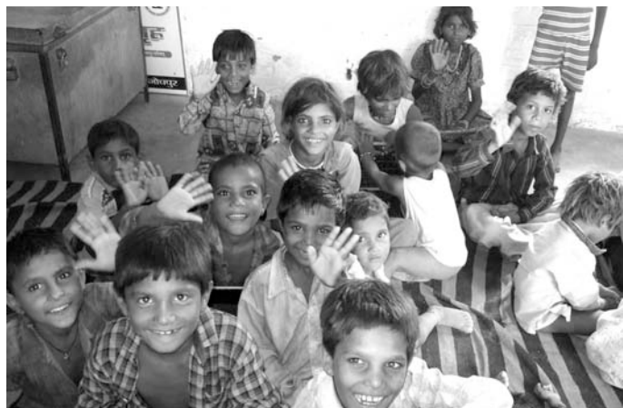
Children at MLPC day care centre (Photo July 2009)

Although the official number of children out of school is only 155,338, 67 the actual number is likely to be much higher than this. According to the 2001 Census, the number of children between 4 and 14 years working as child labour in the state was 1,262,570, constituting 10 per cent of India's entire child labour force and placing Rajasthan behind only Uttar Pradesh and Andhra Pradesh in terms of child labour numbers. The NSSO painted an even more frightening picture in 2004-05, suggesting that 3,488,000 children between 5 and 14 years