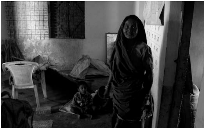
Anganwadi or godown? A sahayaka manages the anganwadi in Khamhariya village (Photo November 2009)

Source: DISE report card, September 2008