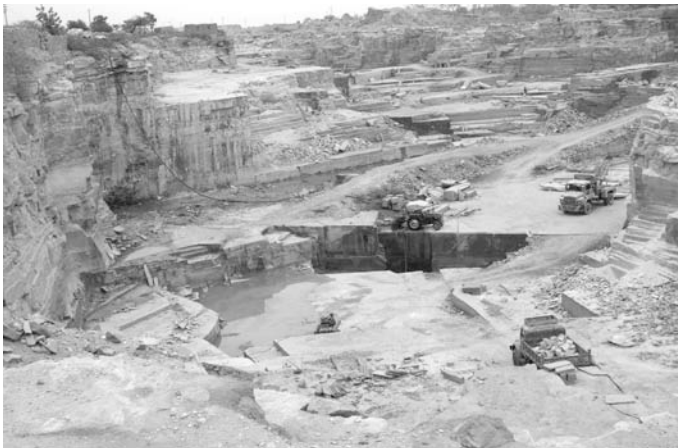
Stagnant water in mine pits, breeding mosquitoes, Kaliber (Photo July 2009)

home, they are forced to return to work within 15–20 days after delivery. One pregnant woman interviewed complained of intense pain in her chest. Besides, the distance to the PHC being too far, the women cannot afford to give their time and money to travelling to the PHC for any treatment.