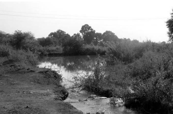
Water crisis! Water contains mine tailings and is unfit for human or animal consumption, Sundergarh (Photo November 2009)

The area has been witnessing serious health problems related to waterborne diseases due to the contamination of water. Problems like filaria, hydrocele and gynaecological problems were reported by the local leaders as well as by the women interviewed. Serious occupational health hazards were reported around the cement factories in Rajgangpur. In the summer months and for many parts of the year, severe water shortage is experienced due to low groundwater levels. It is mainly the girl children who accompany their mothers for collection of water, which is contaminated. They are constantly