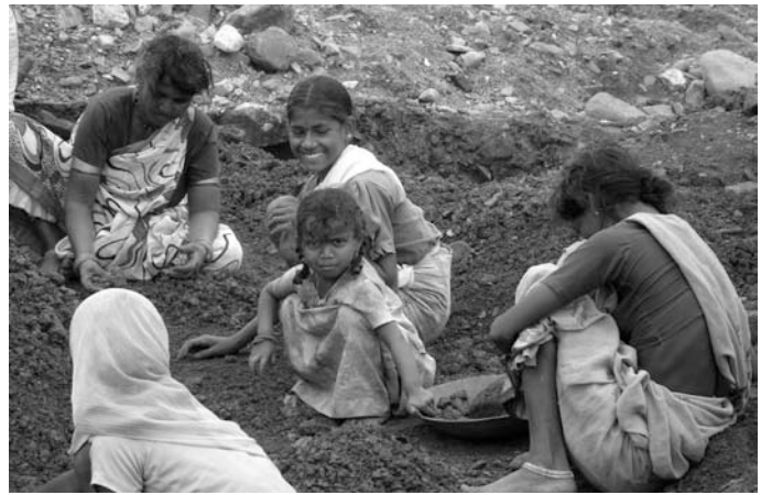
Migrant women and their small children working at an illegal mining site in Sandur (Photo January 2010)

Sandur is known for almost every inch of land being taken on lease by small contractors for iron ore mining. The local people from the mine site visited by us said that, in an area of 20–30 acres there were about 100 illegal mines. In each mine site 7–8 workers were found, mainly women and girls. According to the owner of a mine interviewed, thousands of small contractors sell their iron ore to Obulapuram mining company, which is just 5 km away, at a rate of Rs.4,000 per truck. We found small girls even of the age of 5 years working in these mine sites and when questioned, the mine owner had a straight reply, that as they supply ore to Obulapuram, they do not have to deal with the law or police as these are 'taken care' of by the company.