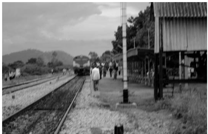
The morning train that leaves from Kolar carries thousands of young boys and girls to work in Bengaluru (photo June 2009)

This immediately shifted the responsibility of supporting the families on teenage children. However, as KGF offers no job opportunities, they have to travel out to the city of Bengaluru approximately 120 km away, in search of employment. The workers sardonically comment on the government's generosity to the BGML employees when they speak about the railway line and the trains that were introduced as compensation for the mine closure. Every morning between 7,000 to 12,000 youth and young adults leave for work to Bengaluru by these trains and return only late in the night. The study team saw packed crowds leaving at 6.00 am in the morning