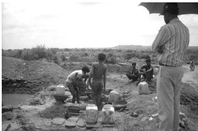
Children working in diamond mines under contractor's supervision (Photo August 2009)

Increasing amounts of land previously used for agriculture had now been converted for mining and quarrying activities. This is an extremely worrying situation, given that around 80 per cent of the state's population still live in rural areas and are dependent on agriculture for their livelihoods. Many of the communities interviewed across all the districts had previously relied upon agriculture or livestock grazing for their survival, but were now working as daily wage labourers in the mines due to lack of available land.