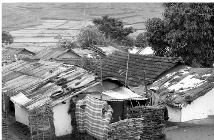
Displaced camp, Damanjodi (Photo June 2009)

Compensation for land was given only to farmers who had pattas (title deeds), so some of the adivasi and dalit families who did not possess pattas did not receive any compensation and also lost their livelihood. The PAPs also reported that most of the families are now working as landless labourers either in agriculture, animal rearing or as daily wage labourers