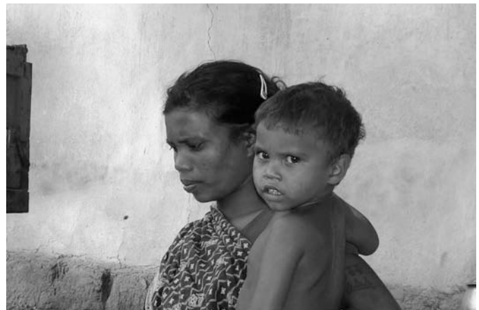
Malnourished mother with malnourished child—mining affected in Damanjodi (Photo January 2010)

The situation in terms of health is also a major concern in the state. Although life expectancy in the state is close to the national average (58.9 years), there are wide rural and urban disparities, with the rural life expectancy being 58.3 years, compared to 66 years in the urban areas. It is estimated that nearly half or 48 per cent of women in Orissa suffer from nutritional deficiency. The numbers are much higher in terms of illiterate women (54.6 per cent) and ST women (55.5 per cent). 230 Malaria is a serious problem in Orissa, with the state contributing to 23 per cent of malaria cases and 50 per cent of malarial deaths in the country. 231 The illness is particularly endemic amongst the ST population in districts such as Koraput located in the south of the state.