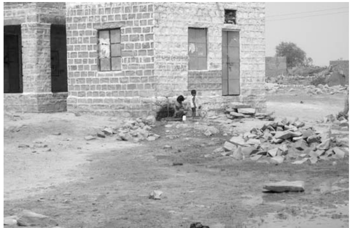
In crisis ridden Jaisalmer, poor water management and seepage (Photo July 2009)

Other villages reported that they were forced to spend a significant percentage of their meagre earnings from mining on water for their basic needs. In Bhat Basti village, there is no water supply so they have to pay for tankers. One tank of water contains 3,000 litres and costs Rs. 400. A woman interviewed in Bhat Basti explained how water was so scarce in their village, that she was unable to bathe her children.