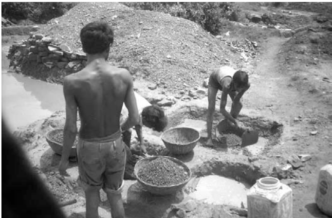
Young boys digging for diamonds (Photo August 2009)

A teenage boy interviewed, stated that he has been working in the mines from the age of 10 and he now gets a daily wage of Rs.70. The stone quarry near Gandhigram village provided evidence of child and adolescent labour. The boys, who were around 17 years of age, explained that they work under a contractor who pays them Rs.35–40 for one piece of stone broken. The boys earn, on an average, Rs.70–100 per day and the material, to their understanding, is sent to the states of Uttar Pradesh, Bihar and Rajasthan and to the city of Bhopal in Madhya Pradesh. They reported that working hours vary from contractor to contractor, but on an average, each boy works for 10 hours daily. All the boys interviewed belonged to the Gond tribe and they have been working for a few years now.