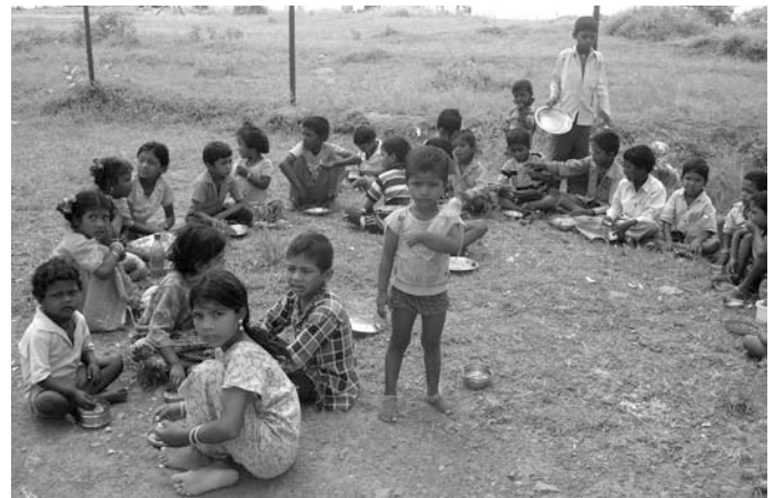
Children of Balshikshan Kendra —in the absence of anganwadis , NGO provides mid-day meal (Photo September 2009)