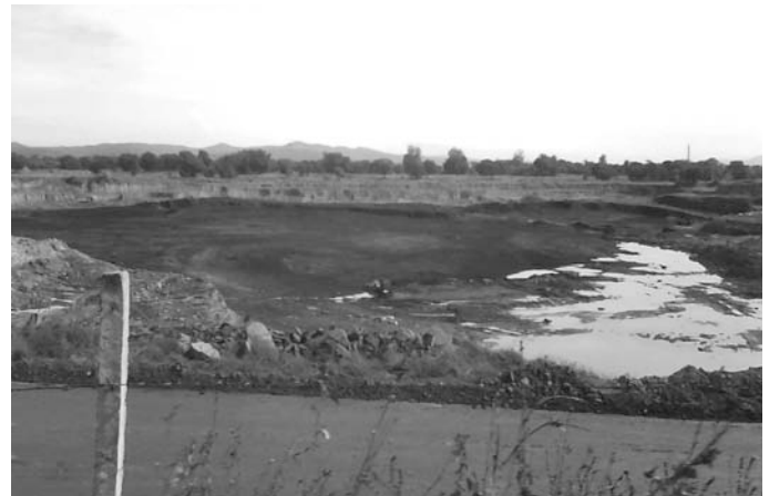
Coal filled agricultural land in Tamnar block (Photo November 2009)

At the time of this study (16 November 2009), a major agitation was taking place against the proposed Jindal Power Plant in Gare village. On 5 January 2008, a public hearing was held amidst strong people's protests as the affected communities were opposed to the project and they had no prior project related information. In spite of this, the district authorities conducted the public hearing by bringing in people