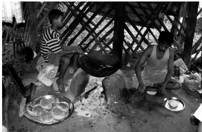
Child labour in Kasipur Area (Photo June 2009)

The anganwadi worker in Tikri stated that the number of child labour is rapidly increasing in the area. At present, around 30 per cent of the children in the age group of 10–15 years are directly or indirectly involved in the mining activities. In the nearest town of the mining project, it can be estimated that at least 500 children are working in the hotels, shops, garages, railway station and tea stalls. 275 From each of the villages affected by the UAIL project, there are an average of 50–60 children and adolescents under 18 years of age, working in the construction site of mining under local contractors. At present (just before closure of the mining activities) there were 400–500 children and youth of both sexes working in the mine site as daily labour.