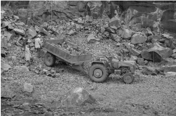
Unsafe working conditions at stone quarries (Photo September 2009)

workers (down from 35,900 in 2004). 48 The 2001 Census indicated that there were a total of 168,112 main and marginal workers in the mining and quarrying sector. 49