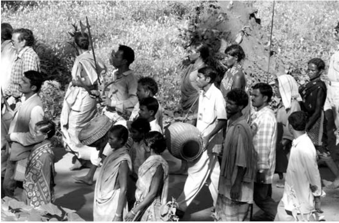
Struggle of people from Kasipur

More than 60 false criminal cases have been filed on the local leaders of the movement so far. People, however, organised rallies, public meetings and strikes to prevent the project from being implemented. On 16 December 2000, police entered the area and opened fire indiscriminately at the people and three adivasis were killed with many seriously injured. Since then, the situation in Kasipur is tense, with clashes between adivasis who are opposing the project and those outside, who are instigated by corporate agents. The interference of police and sporadic clashes that occur every time increase pressure and harassment on people, and have threatened the security and peace in the area. It was with great difficulty that the case study was conducted as the study team, faced antagonism, suspicion and intimidation from the community who have had to deal with constant political and corporate manipulations. Table 2.24 gives some demographic details of the project area in Kasipur.