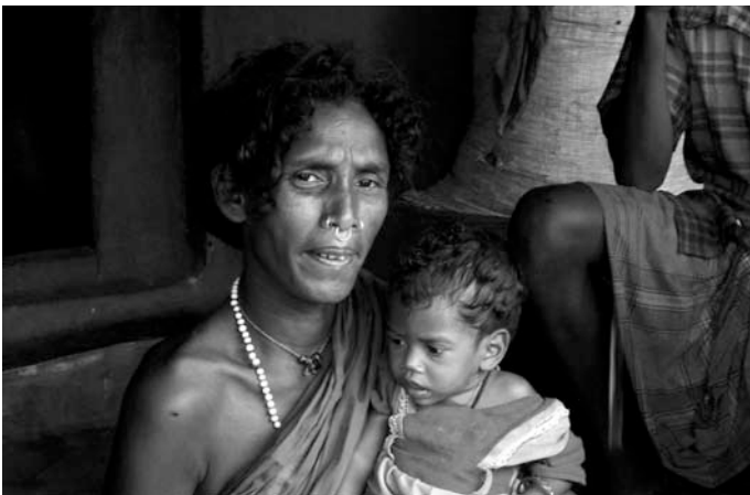
Single woman—vulnerable and destitute, Damanjodi (Photo June 2009)

Villagers have reported 10–15 cases of sexual harassment of the women from their community. Women walking to the mine sites for daily wage work have faced intimidation by migrant labour and truck drivers. 269 Some of the single women and widows who have no other source of livelihood have been forced into the sex trade in the fringes of Damanjodi and Mathalput. Also there were at least 100–200 HIV/AIDs affected persons but it is difficult to give accurate estimates. Damanjodi has acquired the reputation of being the second Ganjam (a city in Koraput district with high incidence of HIV/AIDS) in terms of HIV cases. Considerable number of migrant workers come from Ganjam and coastal belt. 270