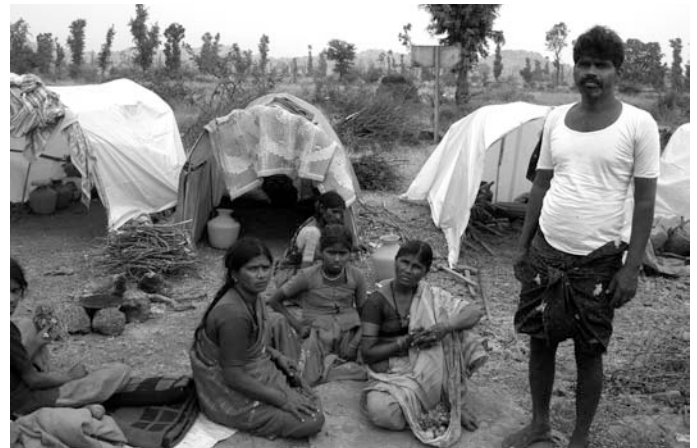
Migrant workers live in small plastic tents no larger than 3-5 sq ft in size, at the mine site, Sandur. (Photo December 2009)

The companies are mainly private operators with a few public sector companies like the National Mineral Development Corporation (NMDC). However, there are more illegal mines than legal ones operating in the district. The mining boom led to a scramble for mining with small contractors and even farmers themselves converting vast areas of agricultural lands into mine pits in a very erratic, uncontrolled and indiscriminate manner.