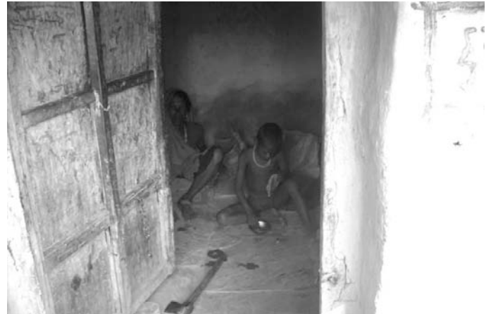
Adivasi child from displaced family, axe at his side, has a frugal meal before leaving for the mines (Photo August 2009)

no work in the village, many of the younger people were migrating to other areas. In addition, with the introduction of NREGA there has been an increase in corruption that has destroyed the peace in the village. The people seconded his comments adding that they do not get even 10–20 days of work in a year, so it really does not provide them any guaranteed employment. Moreover, the Thakurs and Yadavs dominate the villagers and grab whatever schemes reach their village, whether it is BPL cards or NREGA job cards. Wages according to the NREGA is currently Rs.85 per person day.