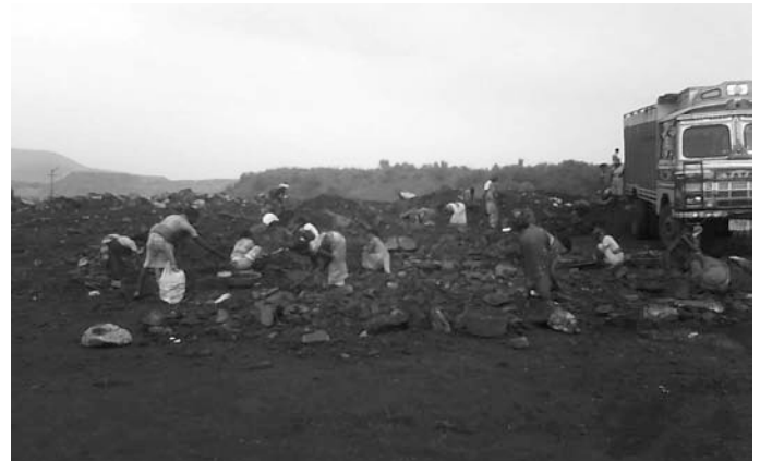
Displaced women, with children at their side, scavenging for coal, the only source of livelihood today, Hazaribagh (Photo September 2009)

In Potanga village, the discussion with the anganwadi worker revealed the terrible health condition of the children. Of the 40 children who are enrolled in the centre (which still does not have any infrastructure and activities are conducted under a tree), five are absolutely (grade IV) malnourished, and 15 come under the Grade II and III categories of malnourishment. Of the seven births recorded in the current year, only two have been institutional deliveries.