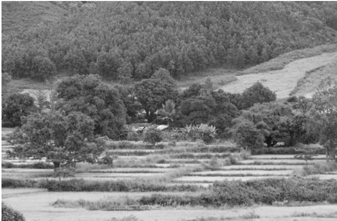
Pre-mining area, Kasipur (Photo June 2009)

Kasipur area is mainly inhabited by adivasis living in the midst of thick forests and hills. These areas are, in legal terminology, called the Scheduled Areas as per the Fifth Schedule of the Indian Constitution where majority adivasis live and have exclusive ownership of land. Out of the total population of the district nearly 72.03 per cent of the people are BPL families 272 and more than 50 per cent of its total population belong to adivasi communities. Kasipur consists of 20 gram panchayats which is a conglomeration of around 270 villages. According to Census 2001, the total population of the block is 67,254. The Jhodia, Kandho, Paraja tribes and the Panos (untouchables or dalits ) constitute around 70–80 per cent of the total population of the block and the rest are OBCs. The adivasis here mainly subsist on agriculture and collection of forest produce.