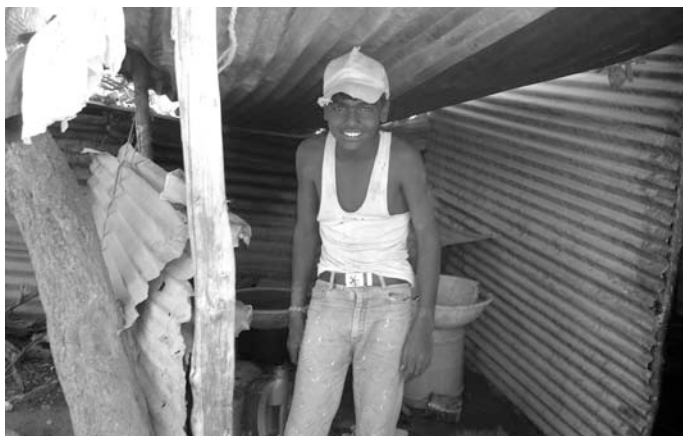
Child worker in stone quarry in Pune (Photo September 2009)