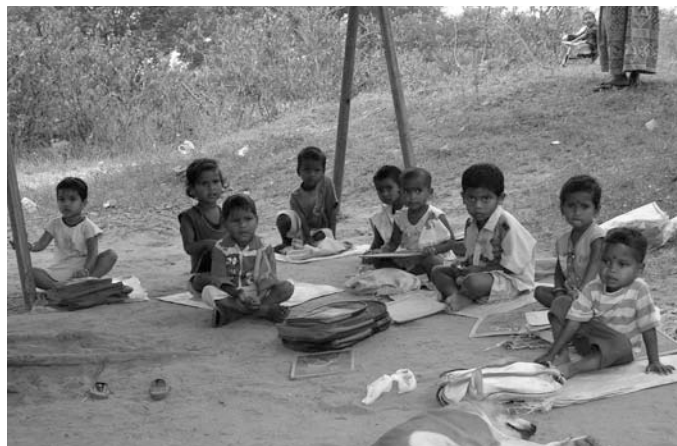
No infrastructure for this anganwadi . Children and animals attending the anganwadi under the trees, Brahmanimara, Sundergarh (Photo November 2009)

of the municipality. In Birmitrapur there are 15 government schools, one college and three high schools. The dakua group (women's SHG) of Birmitrapur which met the team at the anganwadi centre, stated that at least 20–25 children from each ward do not go to school and that every year at least 30 per cent of school-going children drop out of school.