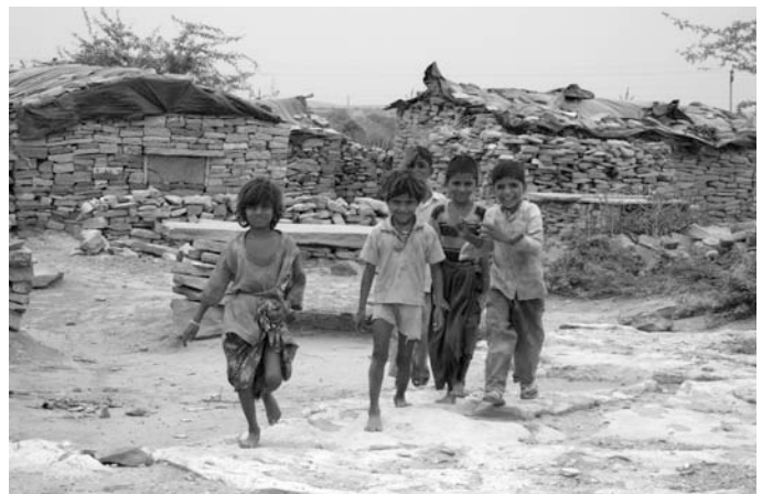
Children of stone quarry workers in Bhat Basti, Jodhpur (Photo July 2009)

Across all three districts, parents recognised the importance of quality education for their children and highlighted this as a major concern in the mining areas. However, in all the communities the same crucial issues around education were raised—the lack of basic facilities in schools, teacher absence, the lack of secondary schools in the area. Parents expressed frustration over the fact that their children have