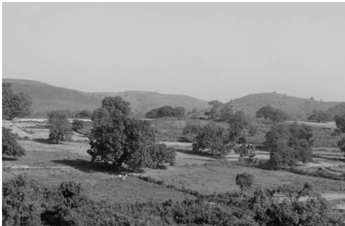
Rich agricultural land proposed for mining, Keonjhar (Photo June 2009)

Source: Interview carried out in Salarapentha, Keonjhar, February 2010