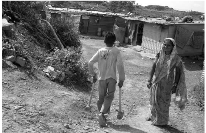
Mother awaits child returning home after a hard day's labour in the mines—each hammer weighs more than 10 kgs (Photo September 2009)

In the nine sites visited, children are attending school only where Santulan, the NGO, runs the Pashan Shalas . The Pashan Shalas were created to rescue the children from working in the mines and currently there are 2001 children enrolled in these schools, scattered across five districts in Maharashtra. But for this intervention, all these 2001 children would have been working in the quarries or helping their parents in petty chores at the mine sites. At Gore Wasti Pashan Shala , the children shared information about their teenage brothers and sisters working in the mines and how most of them had joined work as children. For Santulan, it is difficult to motivate children and adolescents who are already