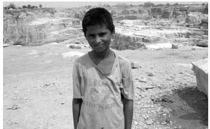
Child engaged in stone quarry at Kaliberi (Photo July 2009)

Thousands of children in the state are out of school and working in the mines and quarries. With the informal nature of the sector, and the vast number of mine and quarry sites across the state, it is difficult to accurately estimate the number of children involved. However, in just one mine in Kaliberi, Jodhpur district, mine workers reported that there were more than 100 children—over 50 of whom are girls—working in the mine and that children tend to start work there when they reach 12 years of age. 113 Children are employed to fill tractors with stones and earn around Rs. 80 for every tractor filled. Children under 12 years of age are