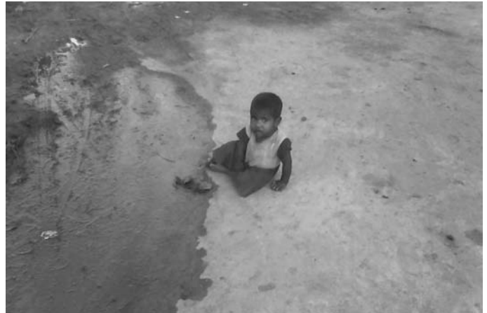
Malnourished child at Mudagaon village (Photo November 2009)

The health department personnel at the PHC admitted that there are far more number of patients approaching the centre now than before and this is because of the health problems being created by mining. The women stated that they prefer to have deliveries at home than at the PHC because of the condition of the roads and poor transport. Earlier there were incidents when women delivered on the way to the PHC due to the strenuous journey on these roads. The nurse also mentioned that three out of five women are suffering from anaemia. The health staff reported that fungal infections and hepatitis are on the rise mainly due to infections from polluted water