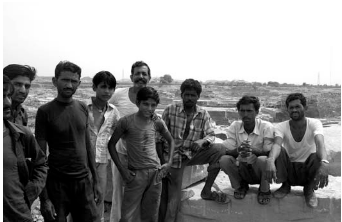
Meeting with stone quarry workers, including child labour at Kaliberi (Photo July 2009)

Several children between 12 and 15 years old were interviewed in the mines around Jodhpur district. Most said that they had been working there for a few months, since they had dropped out of school and earned between Rs. 30 and Rs. 50 a day, filling trucks and doing other similar heavy tasks. 116 Most adult mine workers interviewed said that children earned around Rs. 50–60 per day working in the mines. Several villages explained that only children from the very poor families are working; the others send their children to school. In one village, for example, residents estimated that around 90 per cent of the children in the village attend school; the remaining 10 per cent (around 250 children) were out of school. In this area of Jodhpur district, several children were spotted driving stone-filled trucks; none of these children looked more than 14 years old. None of the children either had any work safety gear that could protect them from the risks of accidents, injuries or even minor bruises. For the children, there is no choice and the risks are high especially during the initial years of work when they had not yet gained the expertise to handle the mining work. The workers reported that they were easily susceptible to eye injuries, mine-slips and mine collapse, breaking of limbs or their back due to falling, or from stones crashing over them.