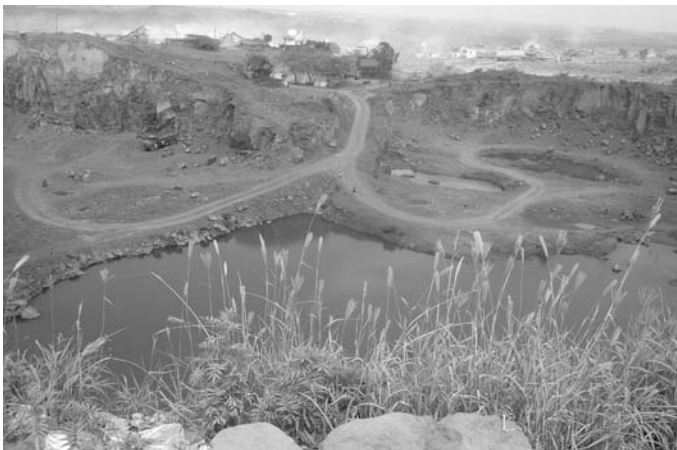
Open cast stone quarries without any protection wall (Photo September 2009)

Apart from the economic reason, children do not have education facilities as the colonies of the mine workers are far from the local village. So the school is too far from their homes, for the children. Parents also expressed their fears about the heavy traffic of tractors carrying loads and said that it was not safe for children to walk on these roads. As the parents leave for work in the early hours of the day and only return late in the evening, the older children have the responsibility of their siblings at the house as well as at the mine site, to watch over them for any blasting or hazardous activities in the surroundings. Besides, the children in the age group of 10–13 have to do most of the household chores, and they are always late for school or have to take their siblings along with them. At noon time, many of the children have to take food for their parents to the mine site.