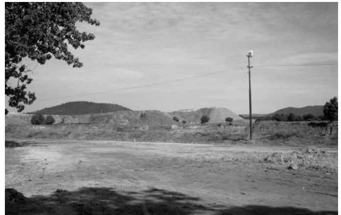
Coal mining area, Raigarh (Photo November 2009)

Chhattisgarh is one of the richest states in India in terms of mineral wealth, producing 28 major minerals. According to the Ministry of Mines the value of mineral production in Chhattisgarh increased by 17.5 per cent at Rs.105.1 billion in 2007-08 from the previous year. This has allowed the state