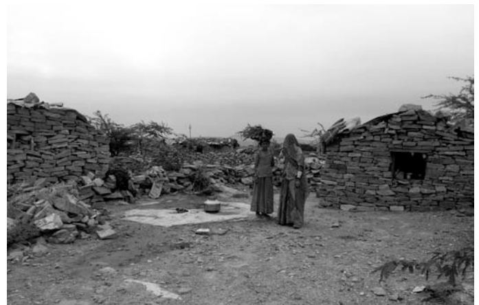
Women and young girls walk long distances for mine work and for water (Photo July 2009)

The research team visited three districts in Rajasthan in July 2009—Jodhpur, Jaisalmer and Barmer. Visits were made to mine sites and quarries, villages engaged in mining, villages located close to mine sites, anganwadi centres and PHCs.