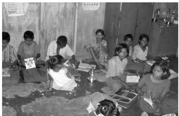
But for these Pashan Shala run by Santulan, children would end up in the mine sites breaking stones (Photo September 2009)

In Sai Stone Quarry (Magoan, Nasik), 60–70 girls out of the 150, are working in the stone crushers, breaking stones and loading. At Mahalaxmi Stone Quarry five children, around 13 years of age, were found to be working and in a nearby quarry, eight children, aged about 10 years, were working at the mine site. The children, who said they were migrants from Bihar, reported that they work in two shifts where four children work in the morning and four in the evening shift. In Matere Stone Quarry, seven children between the ages of 14 and 16 were found working. The women regretted not being able to send their children to the Santulan Pashan Shalas as their economic situation was really desperate. Moshi Stone