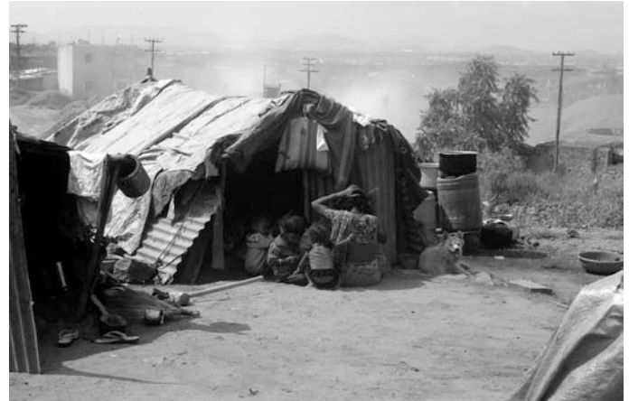
Migrant stone quarry workers' 'houses' surrounded by dust from the quarries (Photo September 2009)

The nine stone quarries visited showed India's dis-respect both to the Constitutional provisions under Article 21 of Right to Life and to the international agreements. It showed how poor and unstable the living conditions of the workers were. If we found any amenities for workers, it was due to the efforts made by Santulan, in getting the workers into assertive collectives. Most of the mine workers' colonies were located away from the main villages, and they were not part of the village community, but settled wherever mine owners allowed them to temporarily set up shacks, close to the mines. In some places, vacant lands were temporarily given to the workers by the local panchayat , based on the negotiations between the mine owners and the panchayat leaders. Hence, the workers were at the mercy of the village leaders.