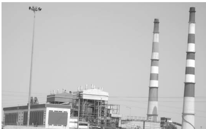
Thermal Power Project in Thumbli village (Photo July 2009)

There were also problems in terms of delayed payments for