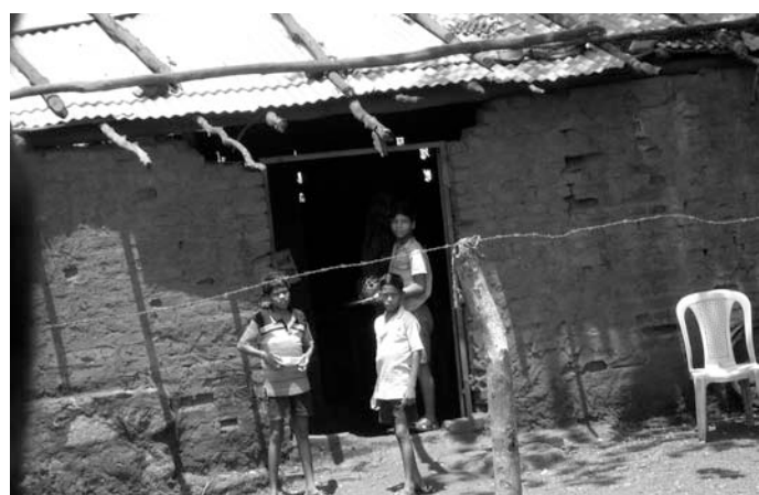
Children working at roadside dabha near Khasia mining site, Keonjhar (Photo July 2009)

In every village, as given in Table 2.33 not less than 50 children are involved in daily wage labour activities. Although there are gaps between number of school drop-outs and number of child labourers, this could be because it also includes children below 6 years of age and some of the children may be staying at home, and not working on a regular basis. Table 2.33 gives information on child labour and school drop-outs in villages visited in Keonjhar.