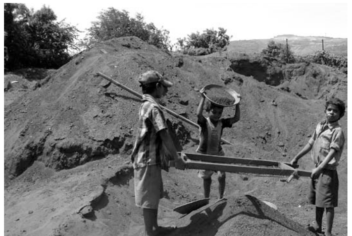
Children of migrant families work at crushing site, This one is in a crushing unit at Hospet (Photo June 2009)

It is difficult to give an exact figure for child labour, but one has to only visit Hospet and spend a whole day walking through the mines, and it is obvious that there are a large