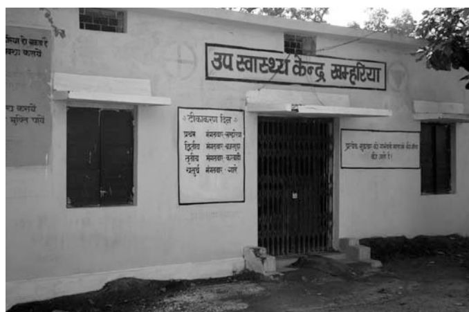
Closed PHC Sub center, Khamhariya (Photo November 2009)

In every village people complained that children suffered from illnesses due to water contamination. Some of the villages like Milupara are close to the mine sites and hence suffer from both water and air pollution. The most common illnesses reported among the children were malaria, diarrhoea, hydrocele, pneumonia, skin ailments, bronchitis, gastroenteritis, abdominal pains, arthritis, jaundice and other respiratory ailments. Hydrocele is reported to have increased in the last 5 years. The villagers observed that water contamination is affecting reproductive health as children are observed to be