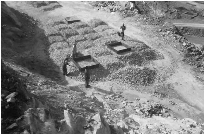
Dolomite mining of BSL, Sundergarh (Photo November 2009)

In spite of the existence of mining companies, migration of unskilled workers is high in Sundergarh, which speaks for the low employment opportunities that mining companies create for local people. This is also the reason why Sundergarh has become one of the junctions for trafficking and migration, especially with respect to young girls being whisked away by organised trade for human labour as well as for prostitution. 271