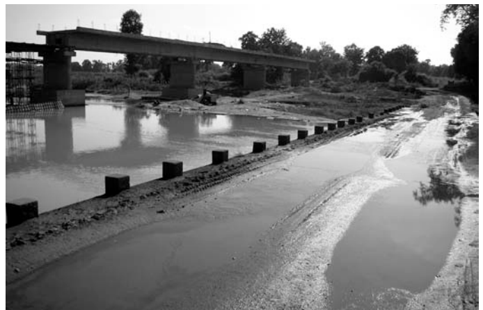
Kelo river in Gare village, life source of an entire region polluted by coal dust (Photo November 2009)

The people in all the villages covered under the study, universally declared that the water of Kelo river cannot be used either for drinking or even for bathing. In the last 3 years, the people have observed how the Kelo river has almost turned black with coal dumping. The people complained that the livestock is also seriously affected due to the water contamination. Besides the depletion of water due to borewells dug up by the