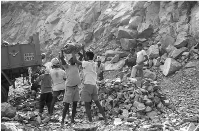
Youth help in loading activities at the quarry sites

Almost all the important minerals are produced in Andhra Pradesh. These include coal, limestone, barytes, dolomite, felspar, iron ore, manganese ore, silica sand, ball clay, laterite and mica (crude). 300