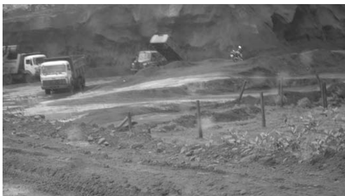
Iron ore being loaded in Badakalamati area, Keonjhar (Photo July 2009)

It was very evident that there was serious air and water pollution in the entire belt of Joda and Barbil. Environmental degradation is perceptible through the reduced forest cover as forests have been cut down, both legally and illegally, for the purpose of mining. In a day, at least 60,000 trucks run through