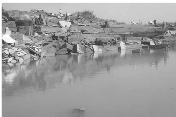
Stone quarries and diamond mines exist together in Panna (Photo August 2009)

Madhya Pradesh is the sole producer of diamonds and slate in India. The state is also the leading producer of copper concentrate, pyrophyllite and diaspore. In 2007-08, the value of mineral production in the state was Rs. 80.62 billion, an increase of 17 per cent from the previous year. 145 Madhya Pradesh accounted for 7.4 per cent of the total mineral production in the country, making it the sixth largest mineral producer in India. There were 319 reporting mines in the state in 2007-08. In terms of general trends, the production of coal and manganese ore in the state has increased over the years, but the production of bauxite and copper ore has decreased.