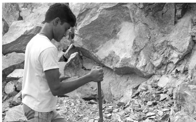
Teenager working in the quarry for the last few years

Minor minerals have a major role in the mining activities in Andhra Pradesh. The state has both major minerals like coal, bauxite, limestone and manganese. Particularly coal and bauxite