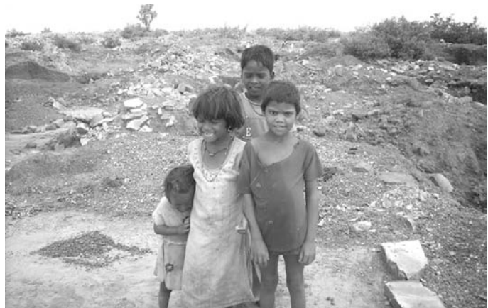
Malnourished and out-of-school, children of mine workers in Panna (Photo August 2009)

In Hardua village that is home to 30 Gond families, around 12 families participated in the group discussion we held regarding the diamond mining activities. None of these families have land and all of them are dependent either on mining, which takes place for 4–5 months in a year, and the rest of the year they either sell wood from the forest