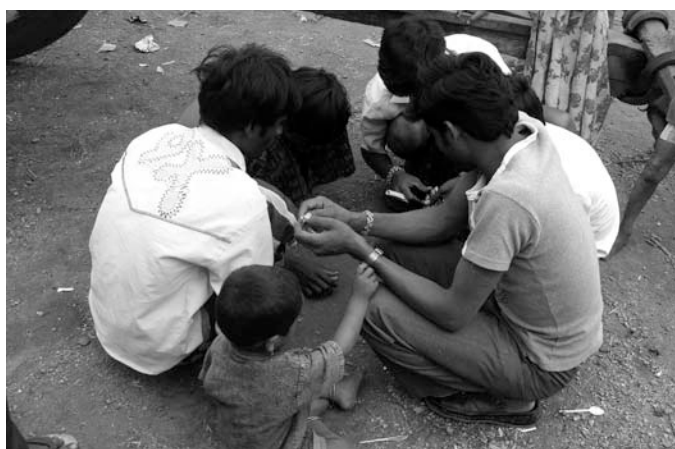
A group of youth gambling in front of the anganwadi with children as audience, at Rajapura in Sandur (Photo December 2009)

was extremely poor and looked as if cooking a meal here would lead to food poisoning or ill-health of the children. The anganwadi has a toilet that cannot be used. The sewage water drains in front of the school serving as a breeding ground for mosquitoes. Some youth were found to be gambling with the money they just earned from the mining trucks, right outside the anganwadi with the anganwadi children peering over them with curiosity. The children reported that the only frequent visitor to the anganwadi is a snake that comes through the crack in the walls. The whole atmosphere reflected how the life of the children in the mining area was insecure and unhealthy, both physically and socially.