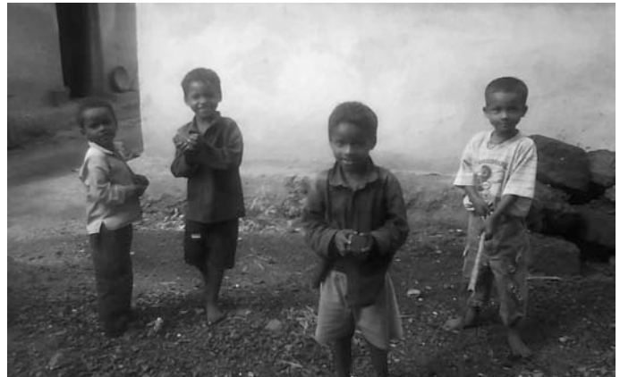
Children play with coal in mining affected community in Urimari Project area, Hazaribagh (Photo September 2009)

In Urimari, 14 villages with 95 per cent adivasi population were displaced by CCL and apart from monetary compensation the villagers reported that they did not receive any other benefits from the company. The young girls working in the mine sites complained that although they were opposed to the expansion of the coal mines, their villages are like islands around mine pits and the mining companies are eating into their village lands till they have no choice but to allow land acquisition.