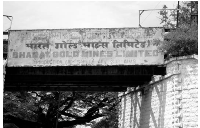
Closed BGML (Photo June 2009)

Based in Kolar district of Karnataka, BGML was a Government of India public sector undertaking, spread over an area of 13,000 acres. Established by the British in 1905, it became BGML in 1972 under the Government of India, Ministry of Mines, and was primarily engaged in the extraction of gold till the year 2002 when it faced a sudden closure on grounds of financial losses. The company extracted 514.17 kg gold in 1997, and in 1998 the revised target was 550 kg of gold but actually only 404.1 kg could be extracted; between January and March of 1999 145 kg was extracted by the company. At the time of closure the company had on its payrolls, a total of 4,345 employees of whom 2,336 were technical and 2,009 were non-technical staff. 27