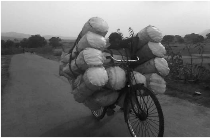
The 'coal boys' – young boys enrolled in school, but out all the time Hazaribagh (Photo September 2009)

The workers reported that the company provides 10 trucks per day for the local people as a source of livelihood for which they get Rs.1,200–1,300 per truck for loading 12 tonnes of coal. This is shared among all the members of the group. On an average, the workers load 18–20 tonnes per truck and get an additional wage of Rs.100 for every tonne. However, their income is entirely dependent on the availability of coal, which is erratic and hence the workers do not earn any money on some days.