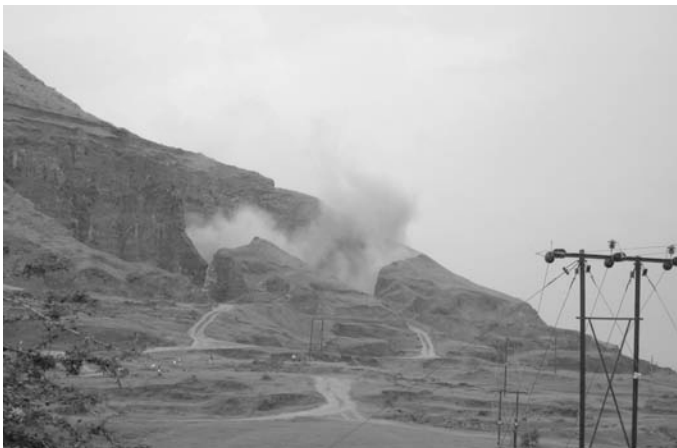
Blasting in stone quarry areas at Nashik....unsafe for surrounding villages and mine workers' colonies (Photo September 2009)

In Suyog Nagar anganwadi , records show that, of the 211 children enrolled, 123 children are malnourished, mostly under Grade I. In most of the mining colonies, there are no anganwadis , neither are there any crèches at the mine site. So infants are taken to the work place, thereby exposing them to the dust, pollution and risk of accidents, as the parents cannot keep a watch over the children continuously. Table 2.05 gives the Bal Shikshan Kendras run by Santulan in the absence of anganwadi centres in the mine workers' colonies between 1997 and 2007. This is a very small sample of children below 6 years of age who are not covered under the Integrated Child Development Services (ICDS) programme which is the basic support institution for nutrition and protection of children. At a state level, there could be a much larger section of this child population who do not have anganwadis and therefore, parents are forced to take them to the mine site with no safety or nutrition available for these infants.