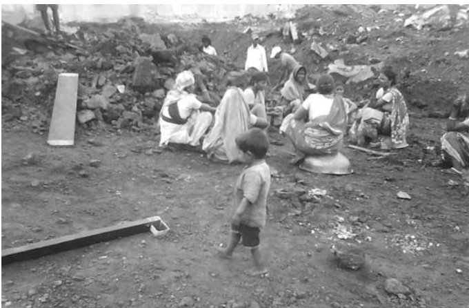
No anganwadi for this child— the mine site is his playground (Photo September 2009)

The water shortage as well as the contamination has been creating an unhygienic atmosphere for the children. They cannot afford to bathe regularly nor can they wear washed clothes. Because of this, children in this area were found