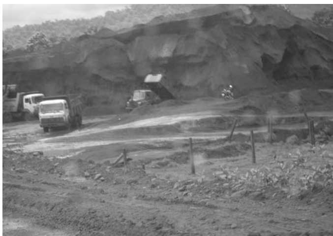
Iron ore being loaded in Joda-Barbil area, Keonjhar (Photo July 2009)

Early marriage continues to be a problem in the state. In Orissa, almost 30 per cent of girls get married before 18 years of age and there is a high degree of inter-state variation. In the backward districts, such as Koraput, Kalahandi and Balangir, more than 50 per cent of girls are married before the age of 18. 250 However, in the coastal districts, such as Puri and Jajpur, less than 15 per cent of girls are married before the age of 18.