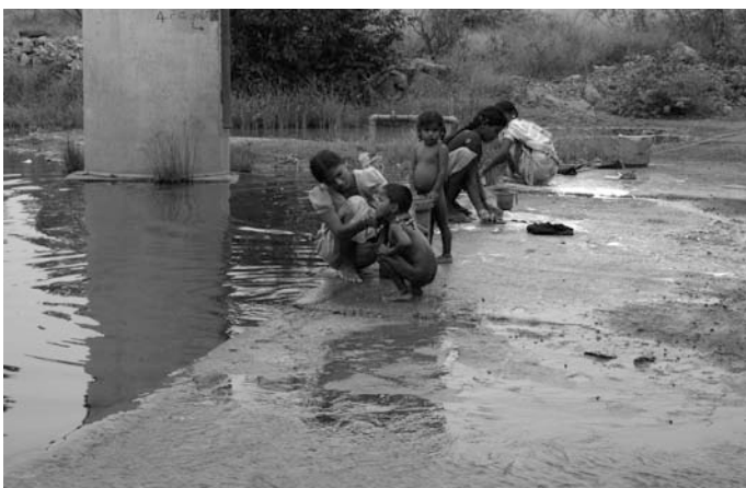
Contaminated water having iron ore waste, the only sources of water for bathing, washing and drinking, Sandur (Photo December 2009)

The dust pollution and depletion of groundwater forced many small farmers to sell their land to mining contractors as agriculture was made unviable. This has badly affected their food security and livelihood because of which children are directly affected in their health and nutrition. Many farmers themselves have been forced into mine labour with their entire families. This has affected the education of children and school drop-out is visible among local children whose villages surround the mining activities. Even if they do not work in the mining activities, the severe dust pollution and contaminated water have affected the general health of children. The doctors and chemist stores that we interacted with in Hospet, stated that chronic respiratory illnesses, allergies, lung diseases, diarrhoea and asthma have increased among children not only of mine workers but of the general public.