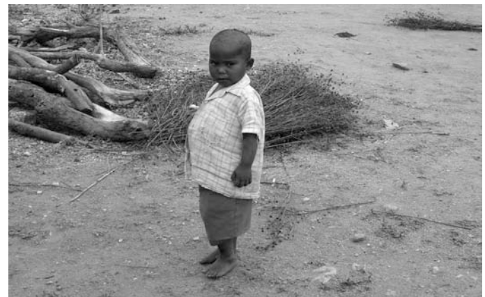
Malnourished child in a mining affected colony (Photo December 2009)

Kariganuru village has 7–8 private clinics which reflect the high rate of illnesses here. Although there was a government TB hospital, it is closed now. The common diseases found in