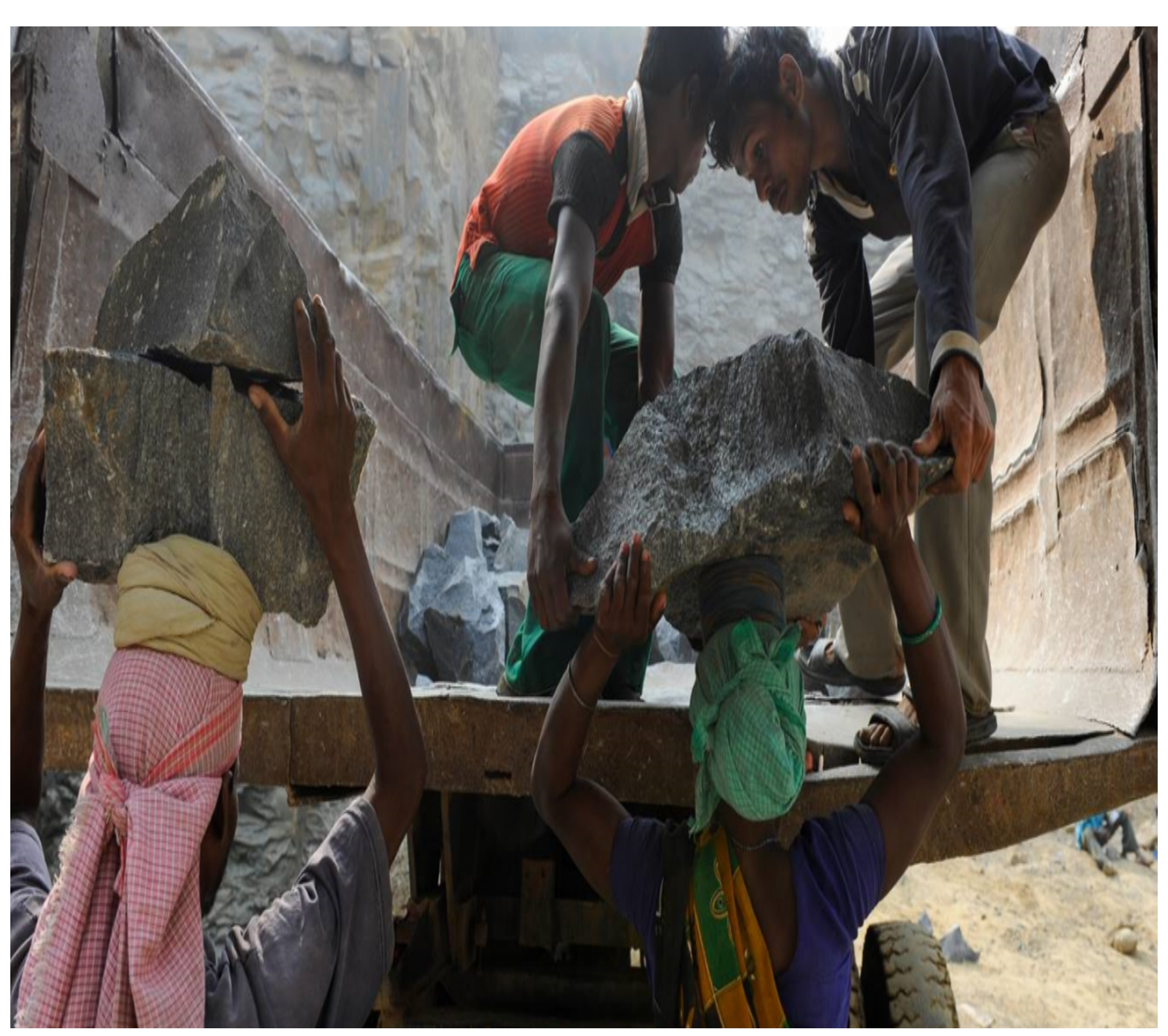
New report: The Dark Sites of Granite

Modern slavery, child labour and unsafe work in Indian granite quarries – What should companies do?