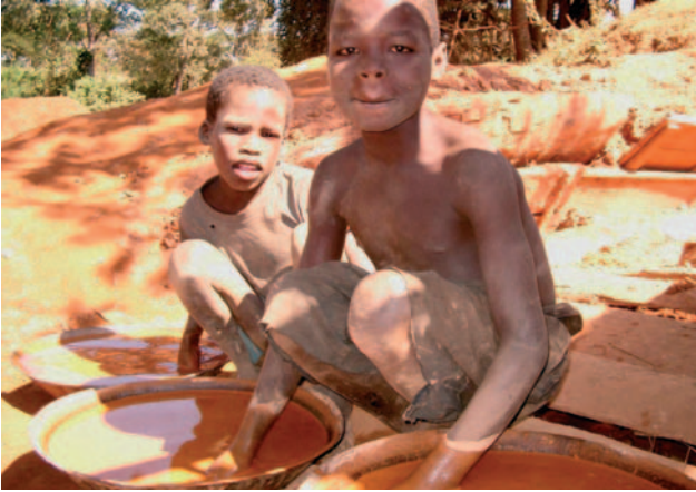
Children using mercury to extract gold. Tanzania.

The image of youngsters, blackened by coal dust lugging laden carts up from tunnels deep underground, stirred the public to call for an end to all child labour in the early days of the twentieth century. A hundred years later, although much reduced, the problem still persists in the small-scale mines of Asia, Africa, Latin America, and even parts of Europe.